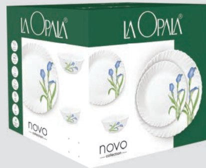
DINNER SET 29/35 PCS