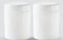
SALT & PEPPER POT