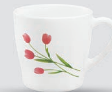
COFFEE MUG CLEO 150 ml