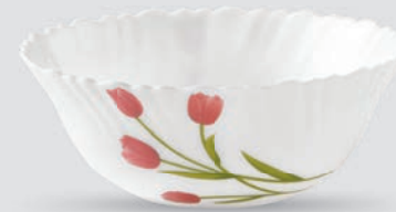
SERVING BOWL (S) 175 mm • 850 ml