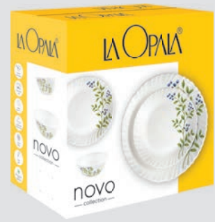
DINNER SET 6 PCS