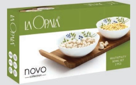
MULTIUTILITY BOWL SET 2 PCS