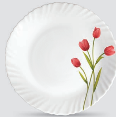
ROUND RICE PLATE 280 mm