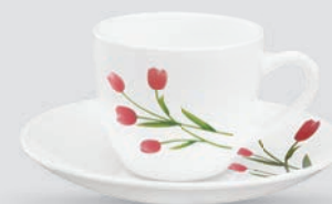
CUP & SAUCER LILY 150 ml