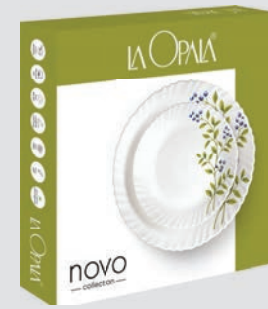
FULL PLATE SET 6 PCS