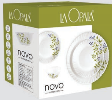
DINNER SET 15 PCS