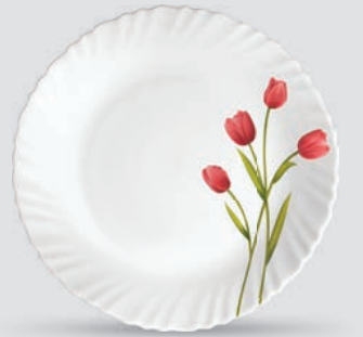
QUARTER PLATE 180 mm