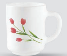
COFFEE MUG GRACE (M) 250 ml