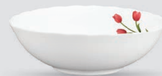
MULTIUTILITY BOWL 155 mm • 575 ml