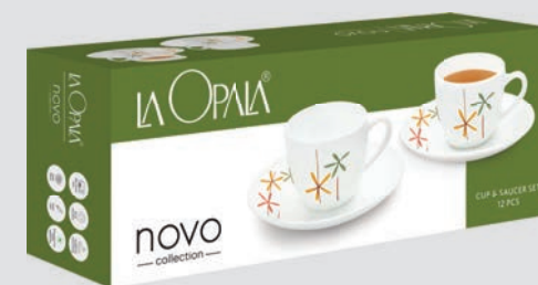
CUP & SAUCER SET LILY 12 PCS