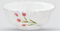
VEG BOWL 100 mm • 175 ml