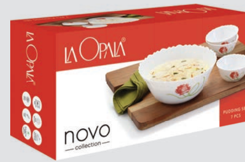
PUDDING SET 7 PCS