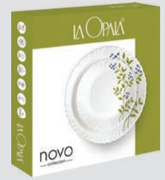
QUARTER PLATE SET 6 PCS