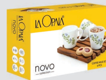
COFFEE MUG SET CLEO 6 PCS