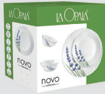
DINNER SET 12 PCS