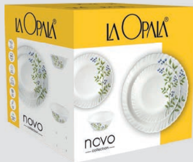
DINNER SET 23 PCS