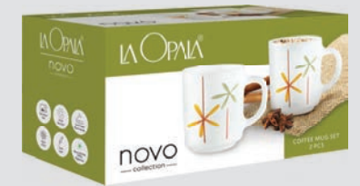
COFFEE MUG SET GRACE (M) 2 PCS