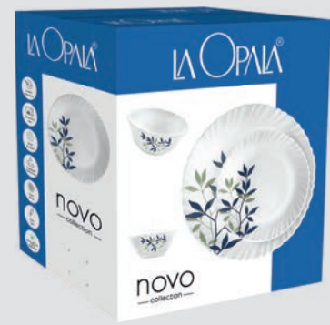
DINNER SET 20 PCS