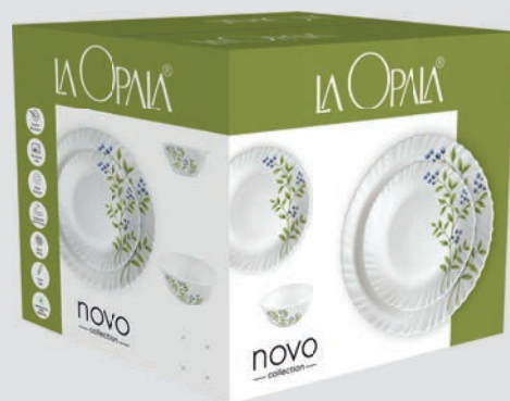
DINNER SET 46 PCS