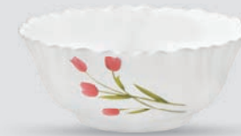
SOUP BOWL 115 mm • 270 ml